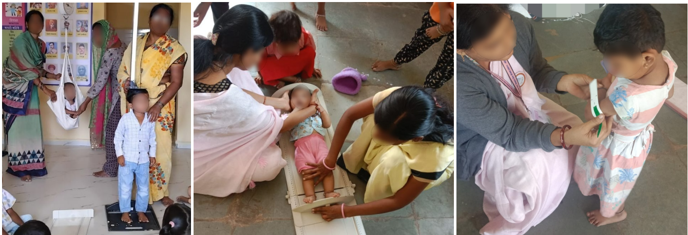
Figure 1: Left: Measuring height of a child by making him stand against a stadiometer and weight of another child by putting her in a pouch, hung from a salter scale and supported by the CHW and her mother for safety concerns ; Middle: Measuring height of neonatal by resting her on an infantometer ; Right: Measuring Mid Upper Arm Circumference (MUAC) of a child on her left arm by using color coded MUAC tape

Satish B. Agnihotri sbagnihotri@iitb.ac.in Indian Institute of Technology Bombay Mumbai, Maharashtra, India