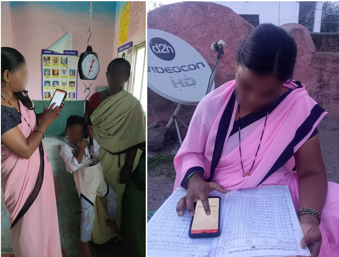
Figure 2: Left: Entering data into smartphone after watching the weight measurement in the salter scale ; Right: Entering data into physical registers and copying it into smartphone